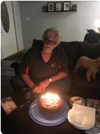
Celebrating his Birthday