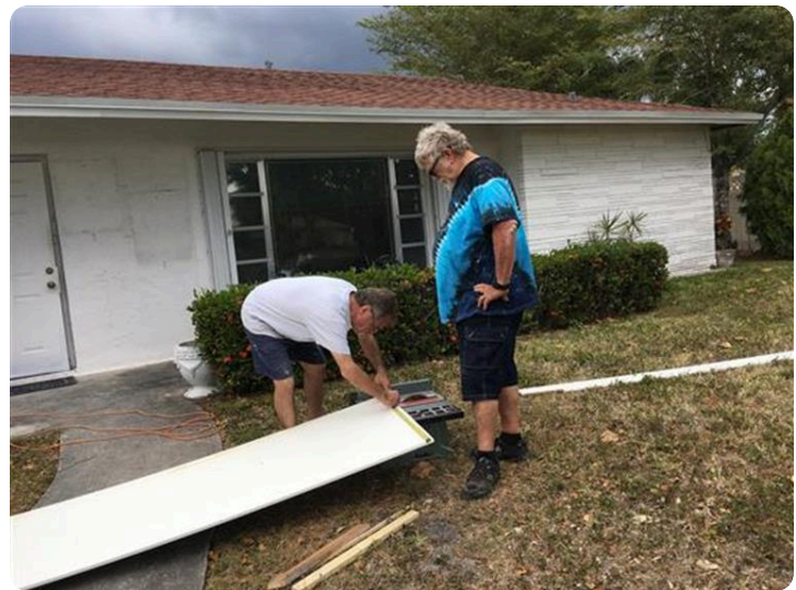
Lending a helping hand