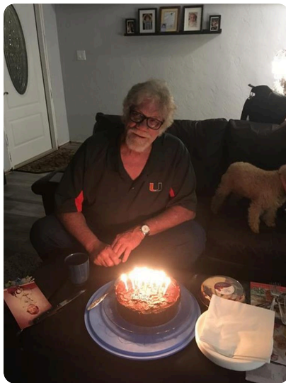
Celebrating his Birthday